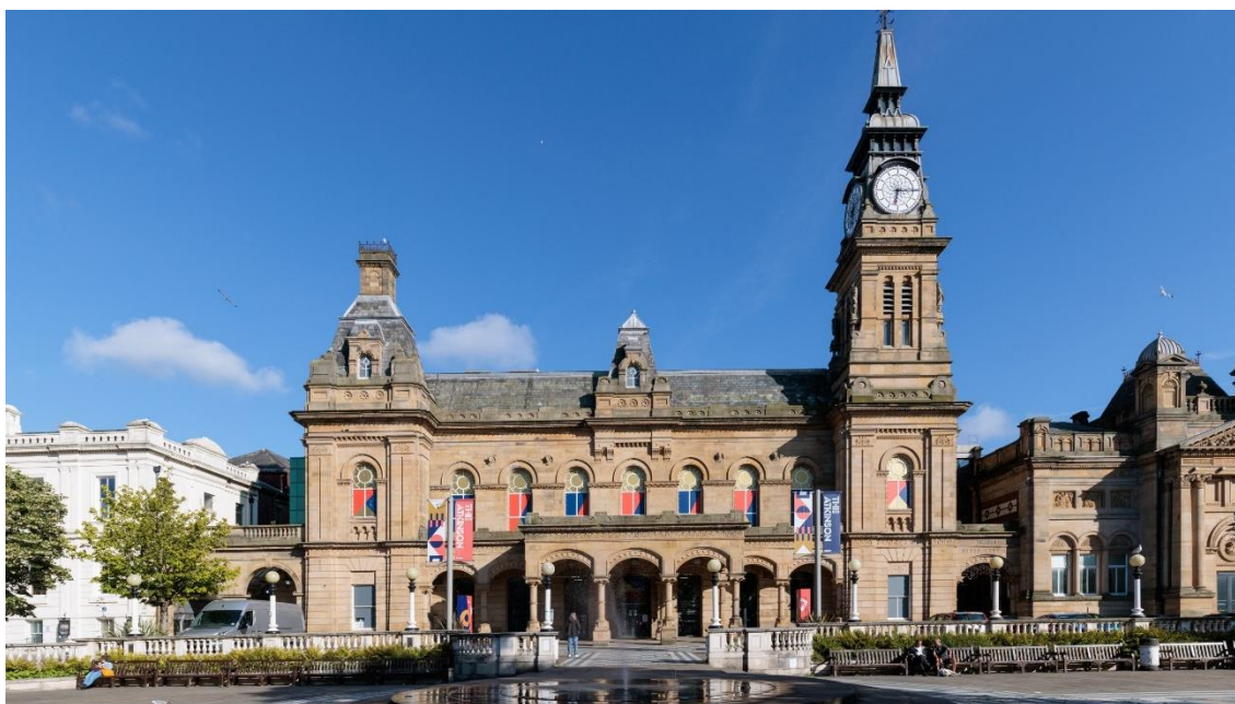
The Atkinson, Lord Street, Southport

Sefton's Arts & Cultural service is based from The Atkinson arts centre in Southport. Significant investment has been made in refurbishing the stunning 19th century buildings. Today, The Atkinson is home to an art gallery, museum, theatre, studio, library, shop and café.