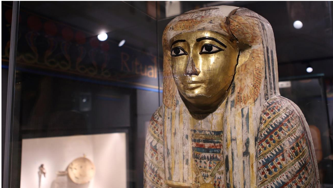
Discover Ancient Egypt, Museum, The Atkinson

Eternal Summer: Paintings by Philip Connard (2024) brought together examples of the Southport born artists work from Britain's national collections. The exhibition was accompanied by a new publication by Stephen Whittle.