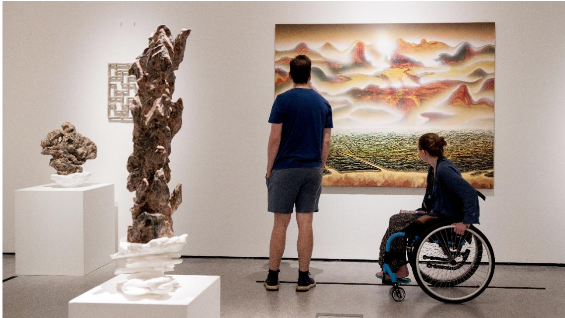
Gordon Cheung: The Garden of Perfect Brightness, The Atkinson, 2023

The Atkinson houses a remarkable collection, including over 3,500 artworks and more than 25,000 pieces of social history, displayed on rotation across the museum and art gallery. Partnerships with Art UK and Bloomberg Connects are supporting The Atkinson to digitize their collections and make them more accessible.