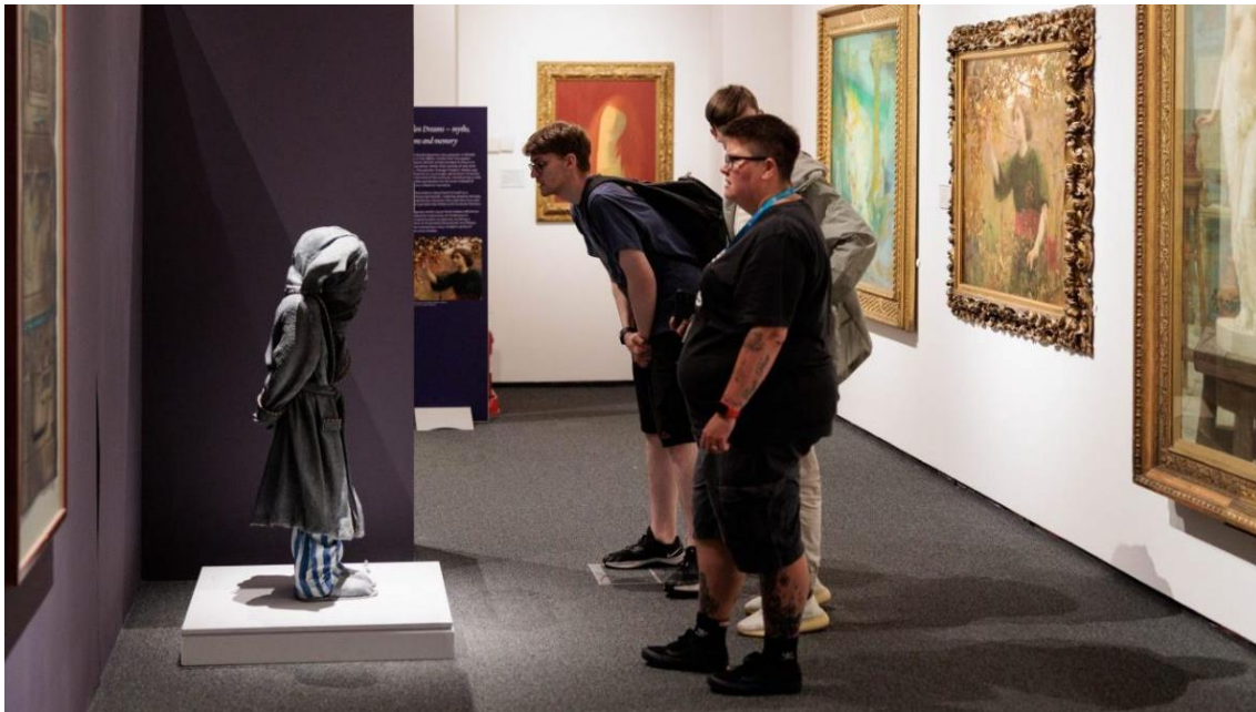
Group visit to The Atkinson's Art Gallery

The Atkinson's collections are the heart of their Learning Programme for schools, higher and further education, providing unique opportunities for unlocking curiosity through creative experiences. They offer a range of practical workshops, engaging museum and gallery tours and interactive drama sessions. In addition, there are subject specialist teacher activity packs and educational materials that can be hired and used in the classroom. The Atkinson also works with teachers to develop bespoke workshops, learning sessions and behind the scenes tours to suit the needs of their students.